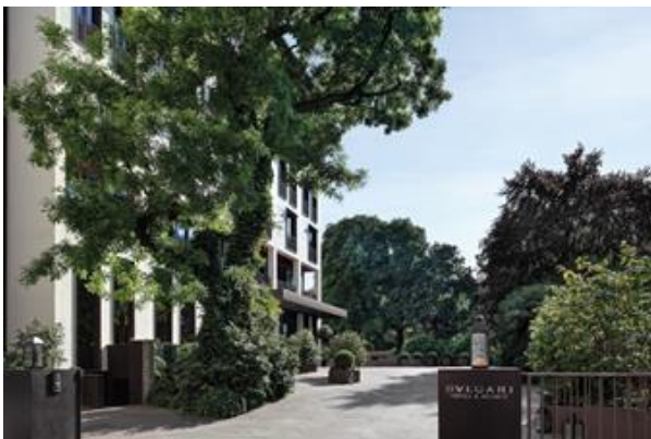
Bvlgari Hotel Milano

Having grown from a collection of three iconic Hotels & Resorts in Milan, London and Bali, Bvlgari Hotels & Resorts has recently be enriched by the Beijing and the Dubai properties . Four new Bvlgari Hotels are due to open from 2018 to 2022 in Shanghai, Moscow, Paris and Tokyo.