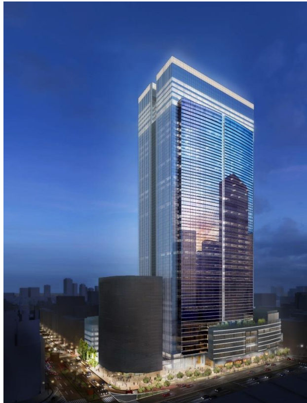
Render of The Bvlgari Hotel Tokyo ※1

Tokyo, Japan, 23 th April 2018 - Mitsui Fudosan Co., Ltd., a leading global real-estate company headquartered in Tokyo, signed an agreement with Bvlgari Hotels & Resorts to open Japan's first Bvlgari Hotel in the large-scale, mixed-use development planned for the Tokyo Station area. The Bvlgari Hotel Tokyo is scheduled to open at the end of 2022.