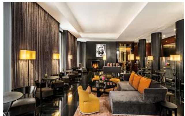
Bvlgari Hotel London