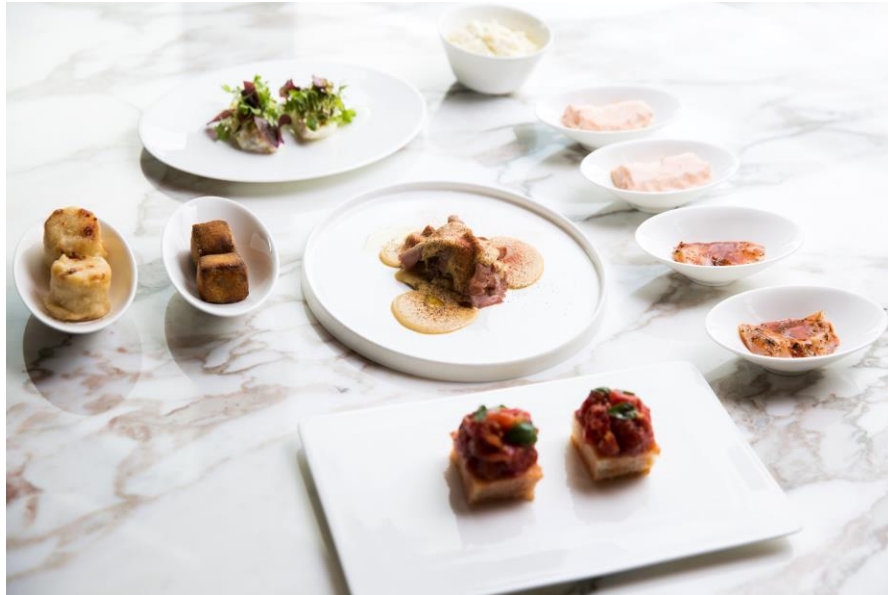
'Antipasto all'italiana' - Il Ristorante Niko Romito at the Bvlgari Hotel Milano