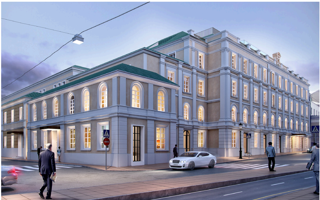
BAR AND RESTAURANT ENTRANCE ON NIKITSKAYA