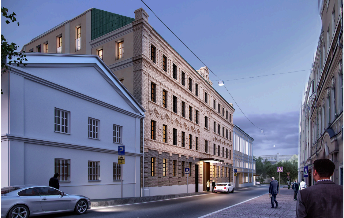
BULGARI HOTEL ENTRANCE ON SR. KISLOVSKY