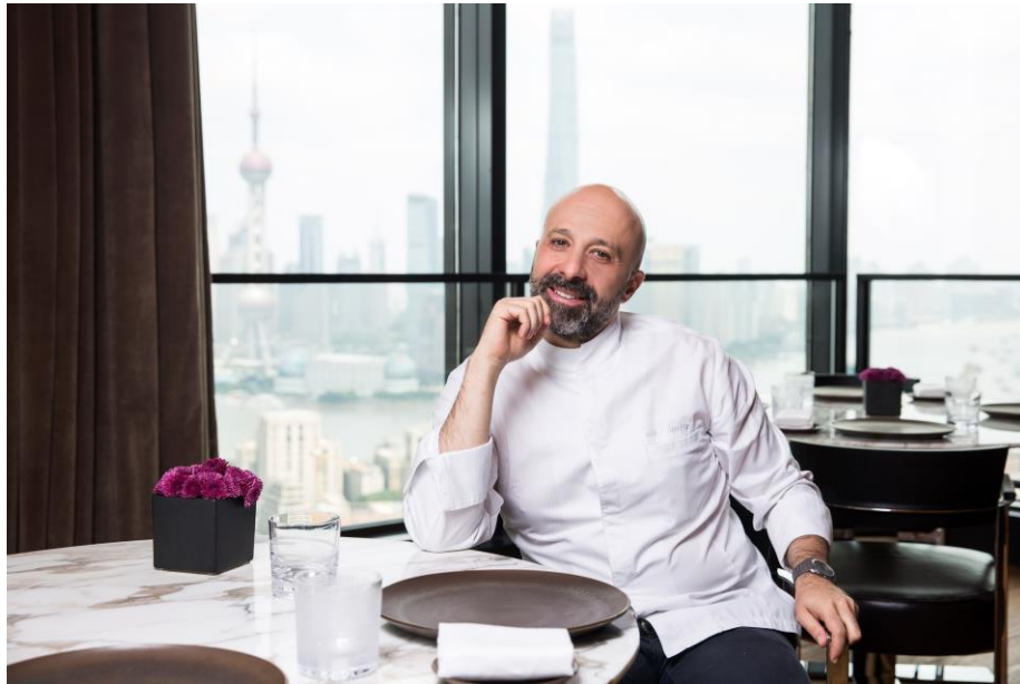
Chef Niko Romito at Il Ristorante Niko Romito – The Bvlgari Hotel Shanghai

ON SEPTEMBER 19TH, IL RISTORANTE NIKO ROMITO AT THE BVLGARI HOTEL SHANGHAI HAS BEEN AWARDED ITS FIRST MICHELIN STAR AFTER ONLY THREE MONTHS FROM OPENING