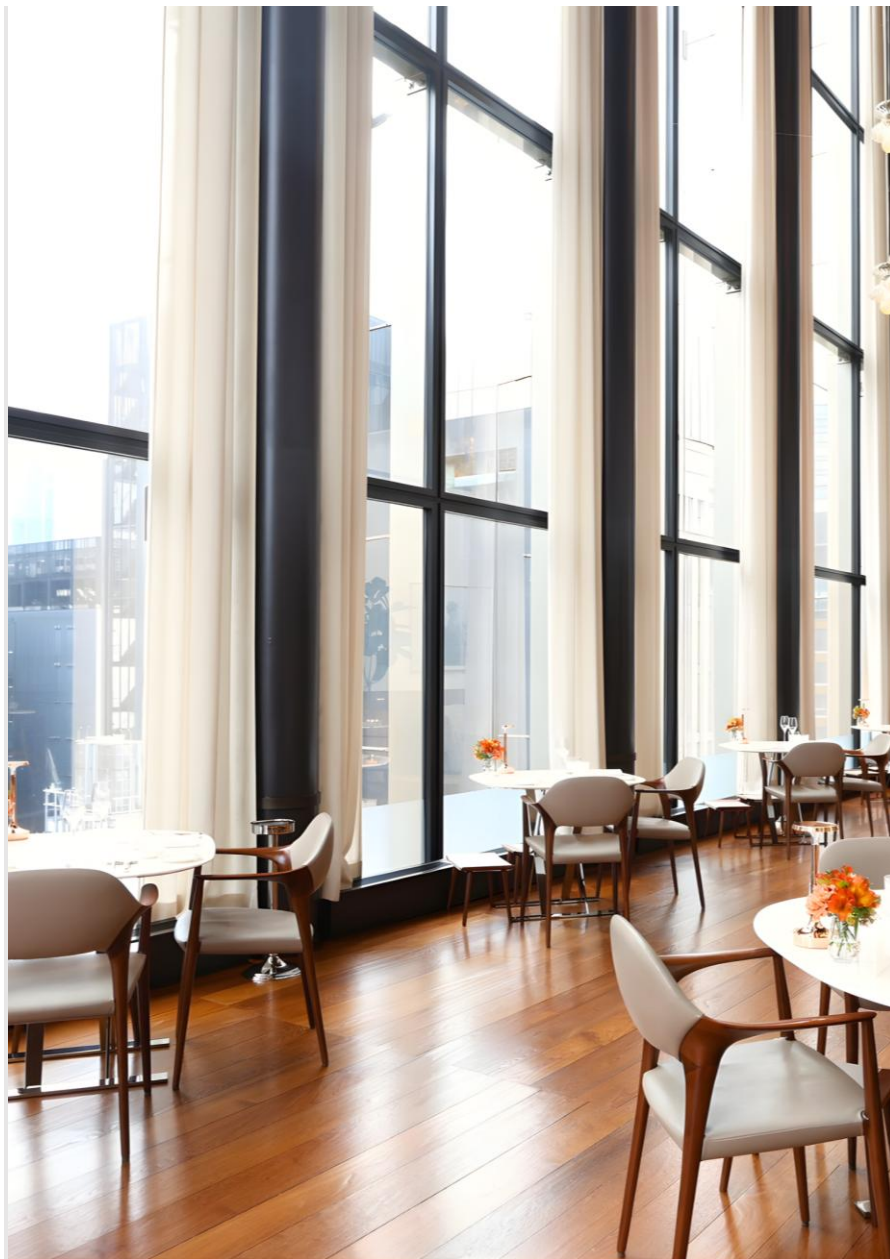
Bvlgari Ginza Café